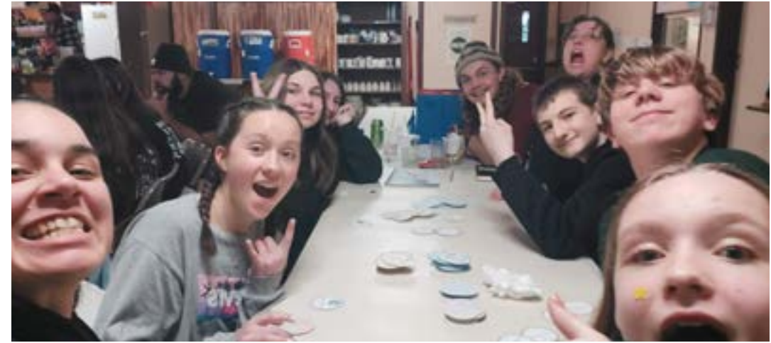
CARD GAMES WITH REEDSPORT FOURSQUARE YOUTH AT WINTER CAMP

When I think about the crucifixion of Jesus, I think of the days leading up to the event. He suffered great anxiety, sadness, and pain as a human being, knowing He was the Son of God. I wonder how I would pray to my Father in heaven knowing that I would be killed for my beliefs. When I think of the days leading to Jesus’s death, I am in angst to know that He will suffer so greatly because of humanity. Then, I beg the question: What would I do? This encourages me to contemplate my actions,