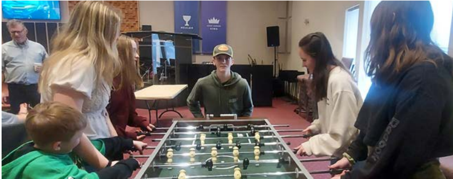
TRIBE LOVES THE FOOSBALL TABLE

beyond; which also includes all of humanity, not just a select few. He did this to declare His purpose so His love could be seen, felt, and realized by all humanity, with Jesus as a model. Then we see the truth spoken by the Apostle Peter in 1 Peter 3:4 (NLT) “You should clothe yourselves instead with the beauty that comes from within, the unfading beauty of a gentle and quiet spirit, which is so precious to God.” For we are to be “His