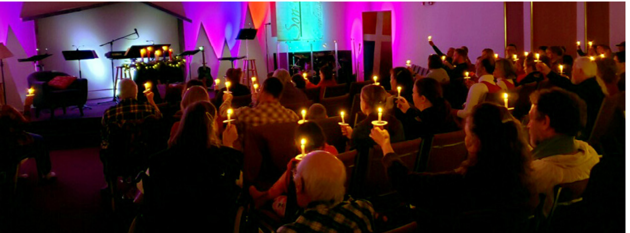
CANDLELIGHT SERVICE, 2019