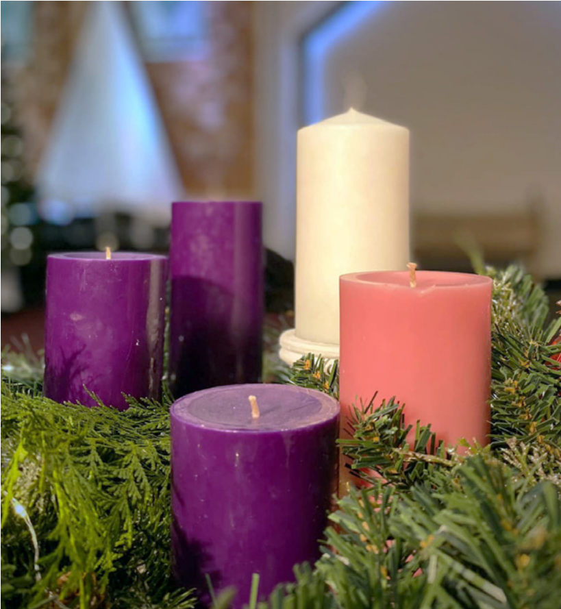
THE ADVENT CANDLES: HOPE (PURPLE), LOVE (PURPLE), JOY (PINK), PEACE (PURPLE), AND CHRIST (WHITE).