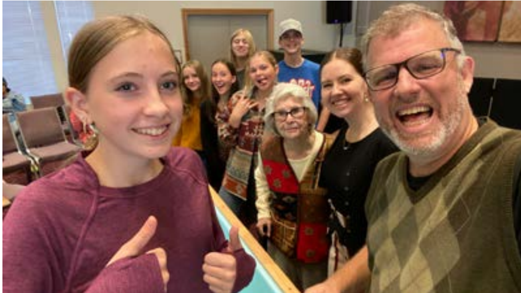
ELIZABETH'S BAPTISM ▲