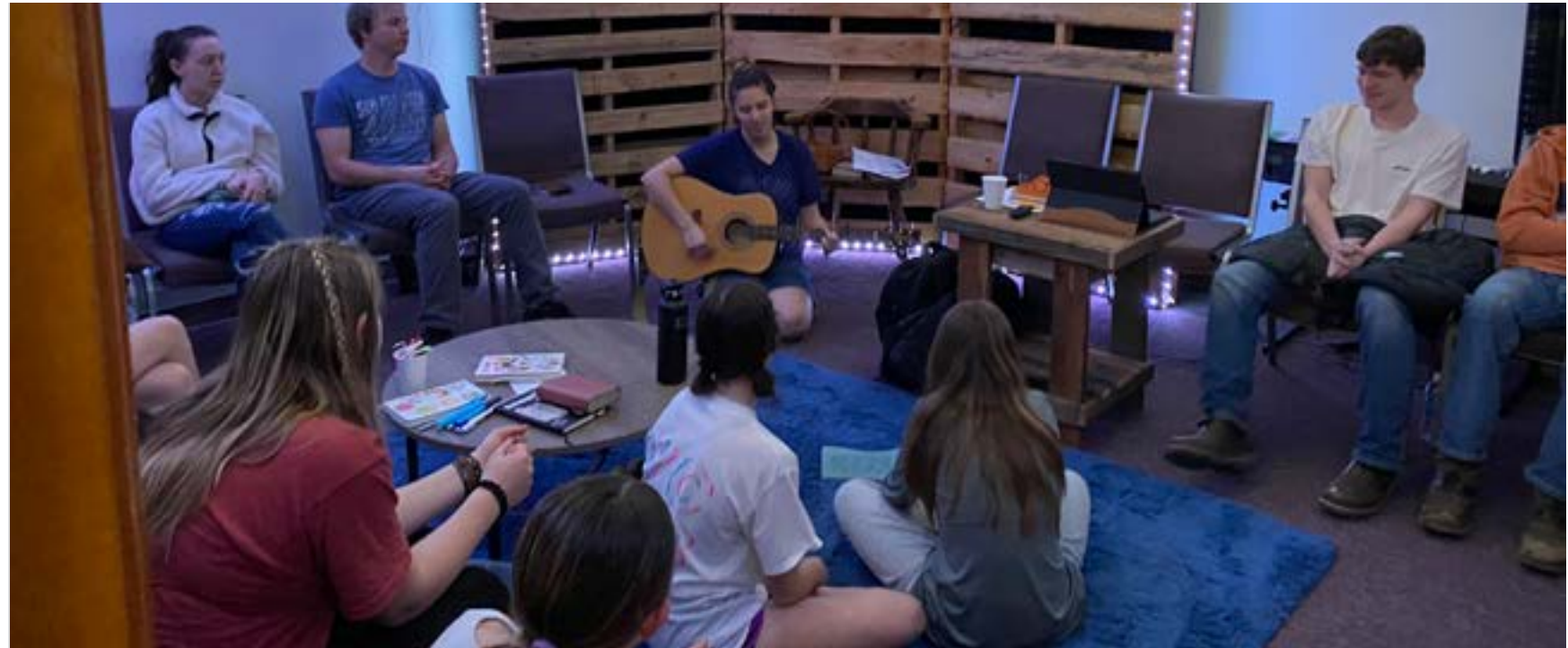
TRIBE ON WEDNESDAY NIGHTS

Jesus would go to the garden of Gethsemane to pray, which was His custom. It was a place of comfort for Him. It is a comfort to us as well.