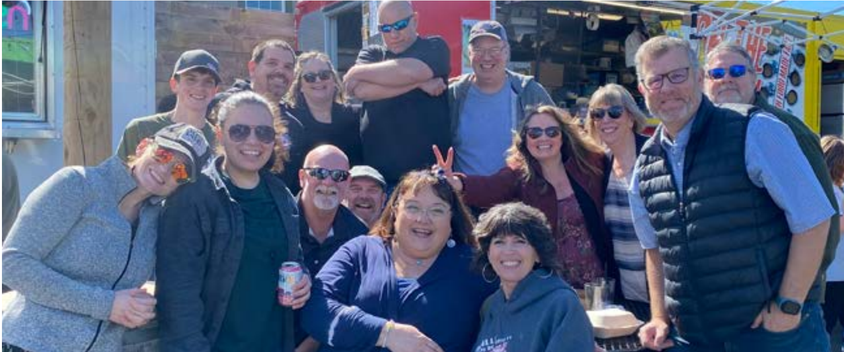
LUNCH AFTER CHURCH AT FRONT STREET FOOD TRUCKS