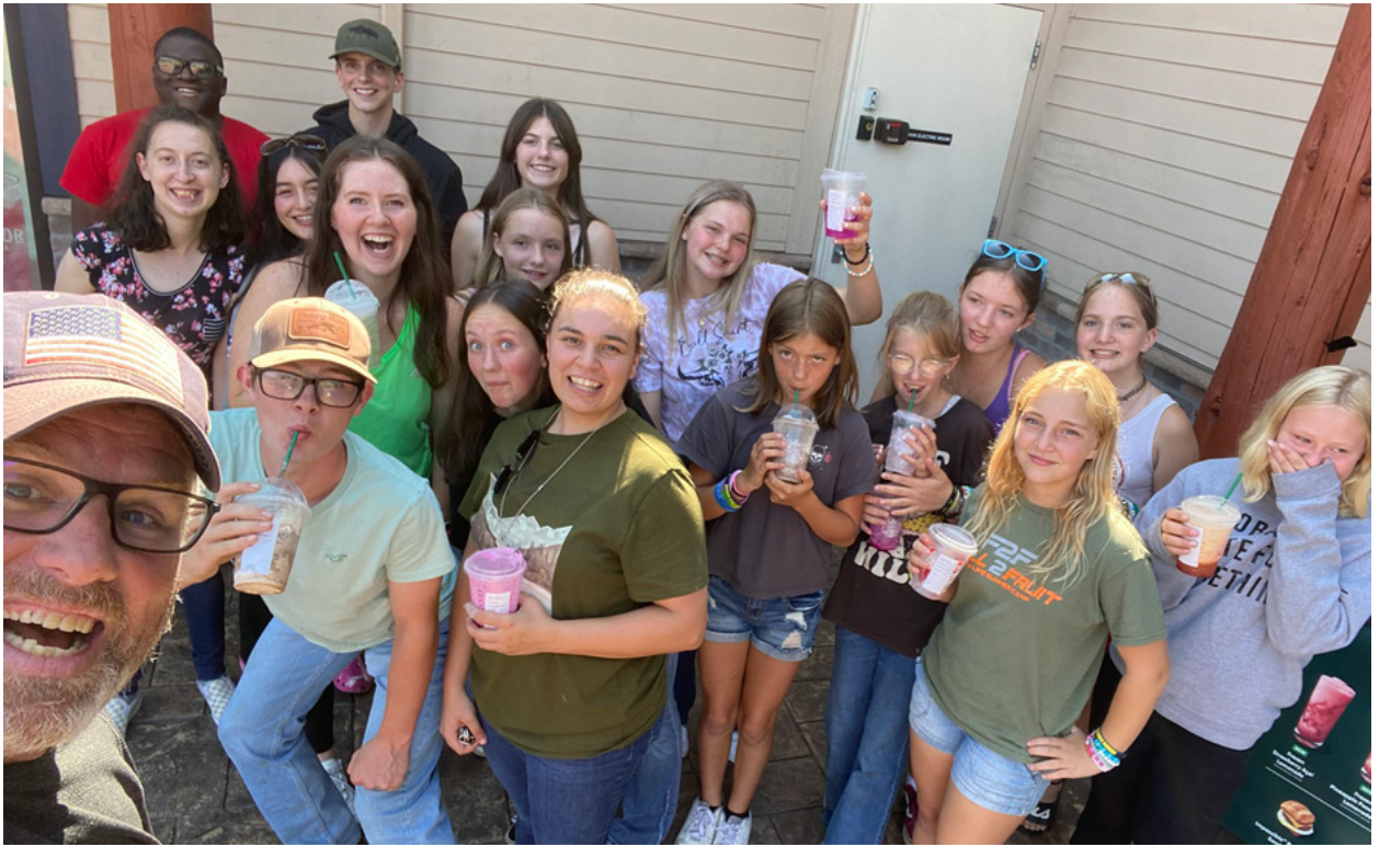
STARBUCKS BEFORE HEADING TO YOUTH CAMP? YES, PLEASE!

woman in the bible was noted for having believed that Jesus' power could be transmitted from his presence through the mere fringe of His clothing.